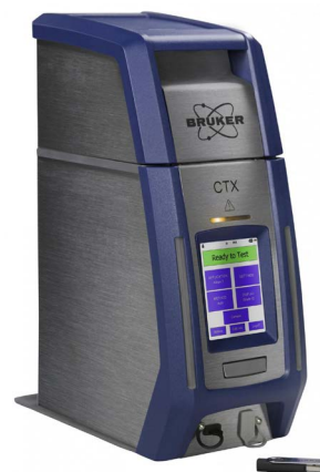
CTX™ Portable XRF analyzer Mg (12) to U (92)