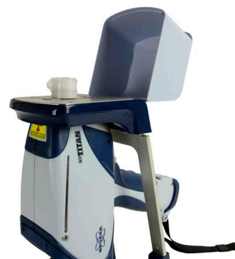
S1 TITAN Handheld XRF analyzer Mg (12) to U (92)