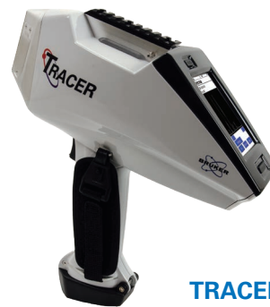
TRACER 5 Handheld XRF analyzer Na (11) to U (92)