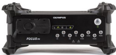
FOCUS PX Acquisition Unit