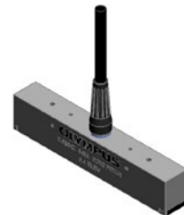
Olympus PA Probes