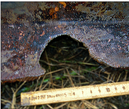
Defect found at location of GWT Indication A1.

Once the roadway was removed the defects shown below confirmed the findings given by the G-Scan inspections.