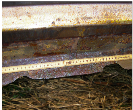
Defects found at locations of GWT Indications A3 & A4.

Email : info@guided-ultrasonics.com Website : www.guided-ultrasonics.com Tel: +44 845 605 0227